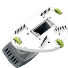
Large suction door and scrubbing brushes