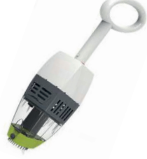
Removable brush head