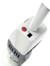
Easy start button